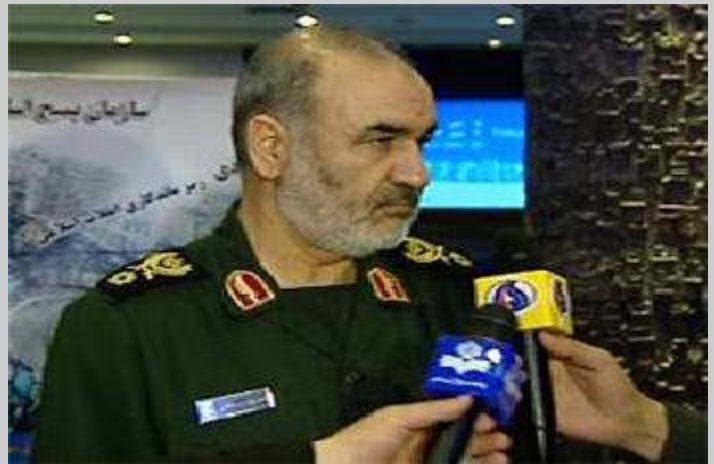
Brigadier General Hossein Salami

“The US is not in a position to affect Iran’s decisions ... The Americans are not qualified to give us permission for carrying out our military strategy,” he said.