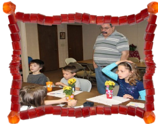
Gifts for Moms for Mother's Day