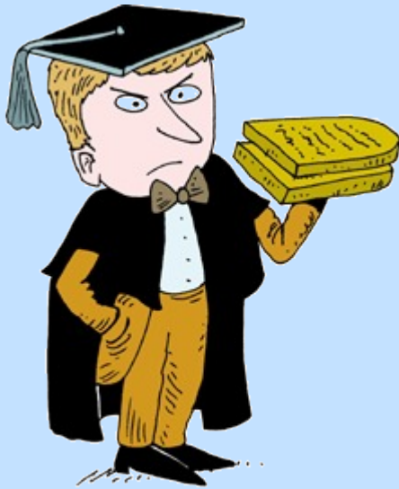
God's Law shows us our need for God's grace

Now, the scribes “were right”, the “Law of Moses” did command that adulterers be put to death, both men and woman. So this is how they thought they had trapped him: