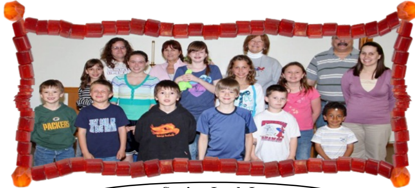
Spring Lock In