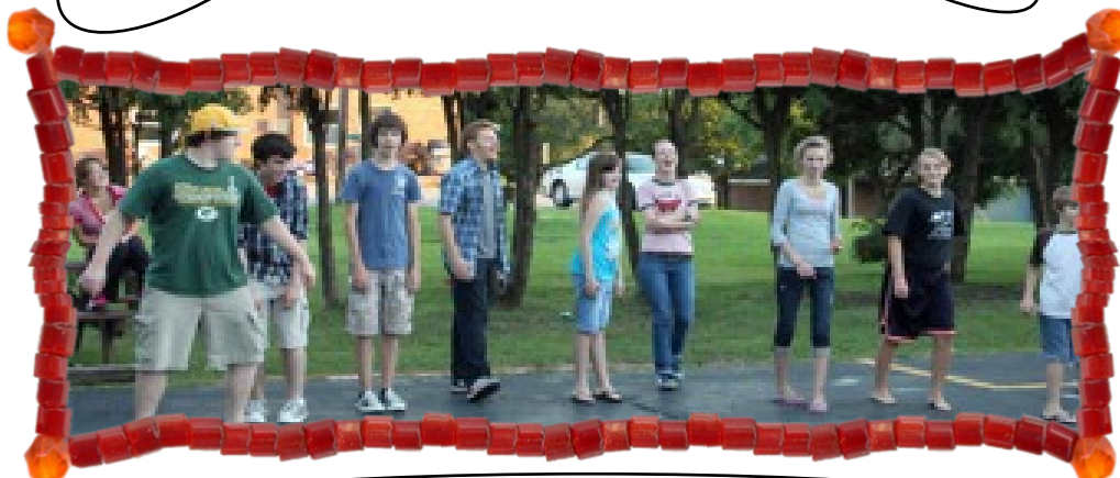
Youth Kick-off on August 24.