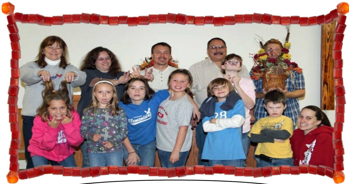
Fall Lock-in For 2nd through 6th grades