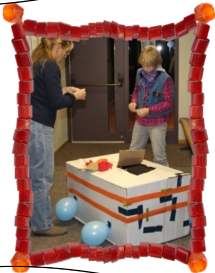
Family Night Built "Cars", Showed Movie Cars2